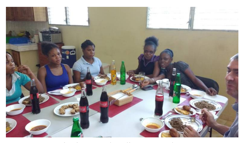
Enjoying Sunday dinner together